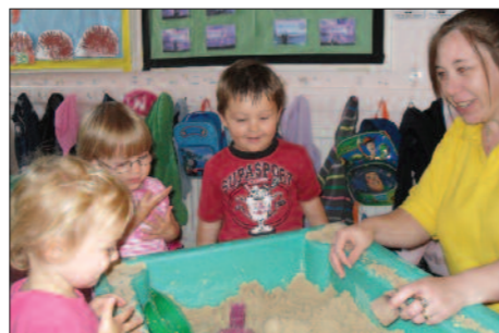
Sand-play is a Batley favourite