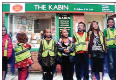
Holiday club at the media museum