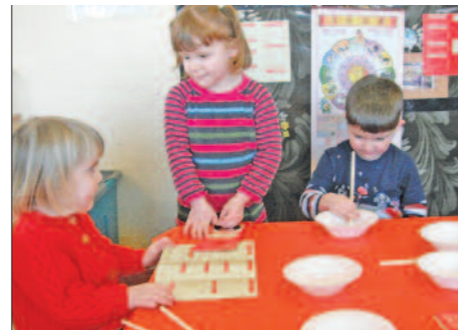
HAPPY NEW YEAR - Chinese style