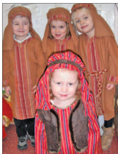
Wakey, wakey, sleepy Scarborough shepherds

A children's clothing store in London was asked to stop selling a babygro outfit that featured an image similar to the famous winged skulls of the Hell's Angels, reported the Metro newspaper. 'Nippaz with Attitude' says it created the best selling babygro to pay homage to the iconic bikers. The garment has now been taken off their website.