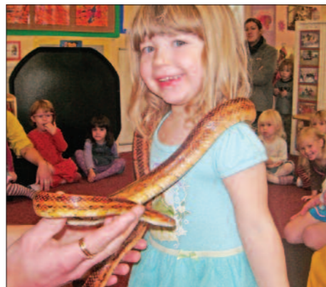
Snakes alive at Boroughbridge!