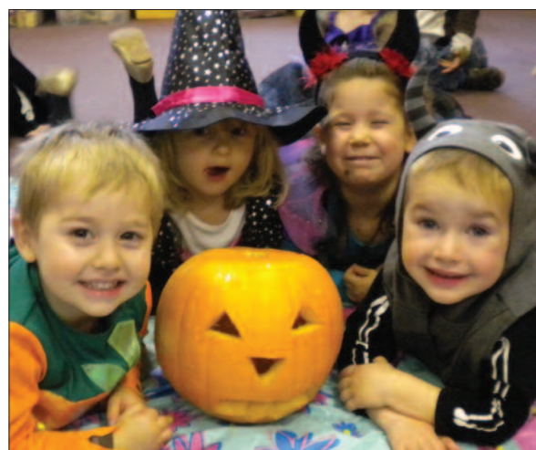
York pre-schoolers get the pumpkin spirit!